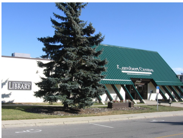
Strathmore Municipal Library - 2012