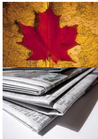
Nearly 300 newspapers to choose from!

Canadian newsstand: key facts. (n.d.) Retrieved from http://www.proquest.com/en-US/catalogs/databases/detail/canadian_newsstand.shtml