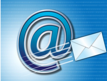
Phone & Email renewals welcome!